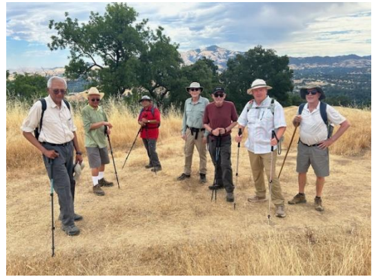
Las Trampas Regional Wilderness Alamo