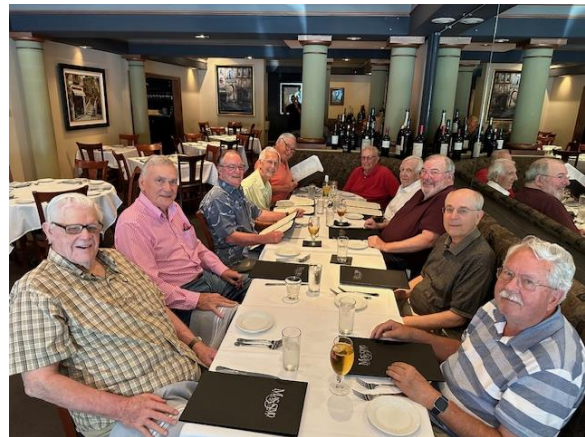
Single SIRS at Massimo Ristorante in Walnut Creek