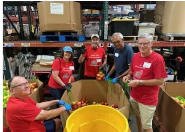
SIR Giving Back at the Food Bank in July